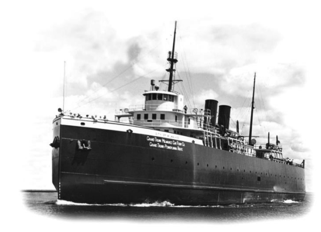
S.S. CITY OF MILWAUKEE