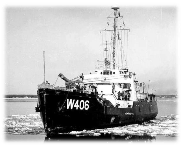
USCGC ACACIA WLB-406